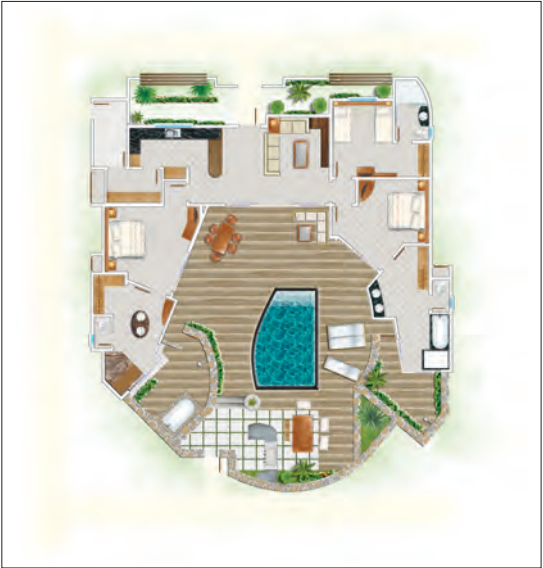
3-Bedroom Pool Villa