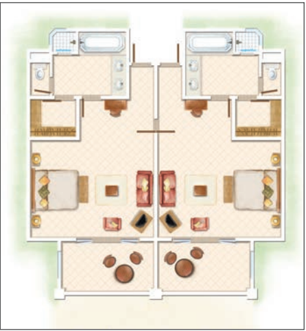
2-Bedroom Deluxe Family Apartment (2 interleading rooms)