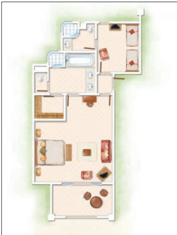
2-Bedroom Family Apartment (First Floor) / 2-Bedroom Family Apartment (Ground Floor)