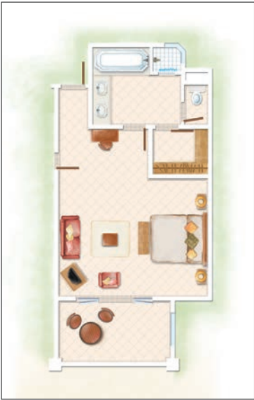
Deluxe Room (Upper Floor) / Deluxe Room (Ground Floor)