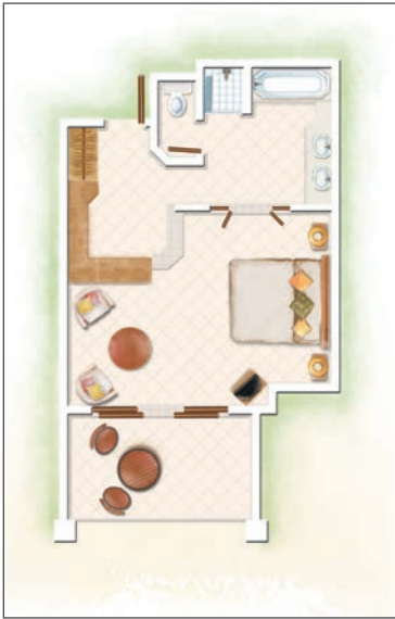
Tropical Room (Upper Floor) / Tropical Room (Ground Floor)