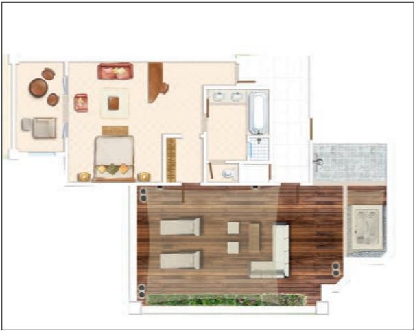
Rooftop Deluxe Room