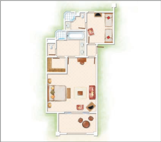
2-Bedroom Family Apartment / 2-Bedroom Family Apartment Ground Floor