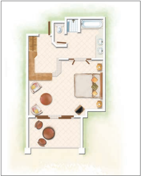
Superior Room / Superior Ground floor