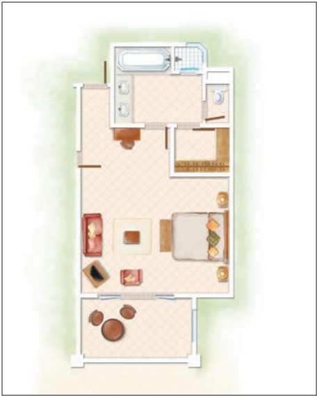
Deluxe Room / Deluxe Ground Floor