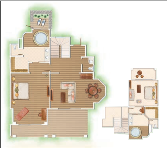
2-Bedroom Family Suite