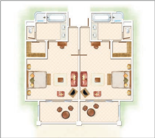
2-Bedroom Deluxe Family Apartment