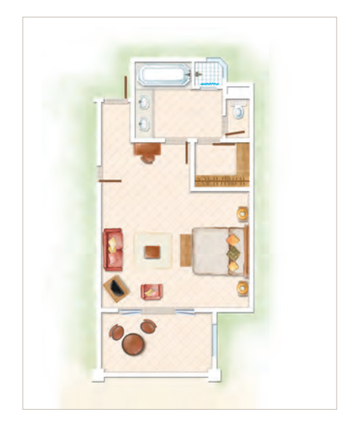
Deluxe Room / Deluxe Ground Floor