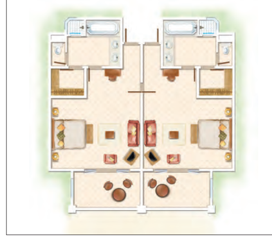
2-Bedroom Deluxe Family Apartment