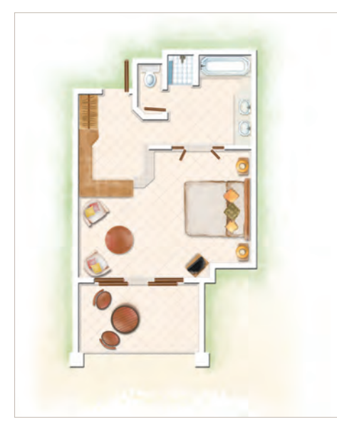
Superior Room / Superior Ground floor