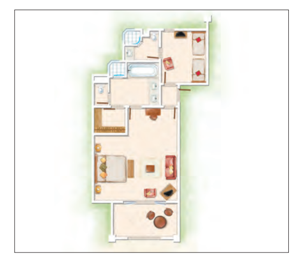
2-Bedroom Family Apartment (First Floor) / 2-Bedroom Family Apartment (Ground Floor)