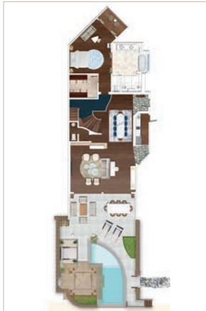
Royal Villa - Ground Floor