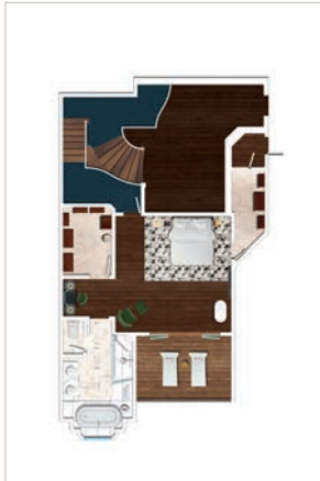
Royal Villa - First Floor