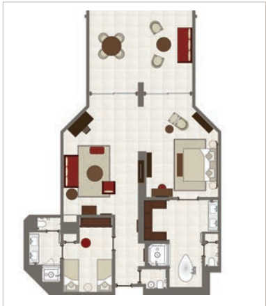
Palm Suite Family