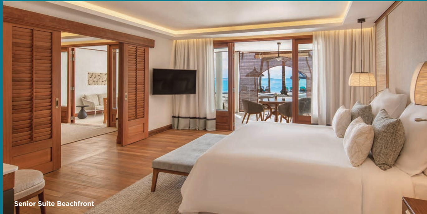
Senior Suite Beachfront