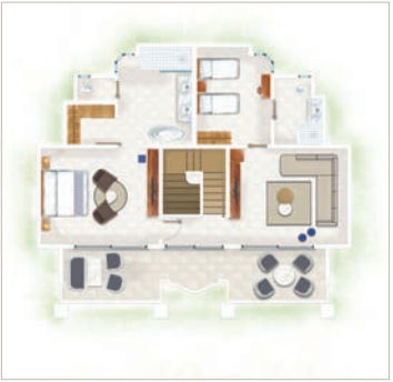
Paradis Luxury Family Suite (Beachfront)