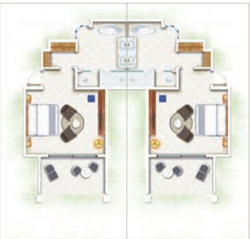
2-bedroom Paradis Family Suite (Beachfront) (2 interleading rooms)