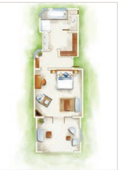
Junior Suite / Junior Suite (Beachfront)