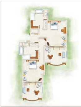
2-bedroom Junior Family Suite / 2-bedroom Junior Family Suite (Beachfront)