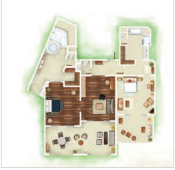
2-bedroom Senior Family Suite (Beachfront)