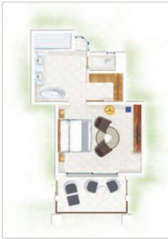
Paradis Bay Facing