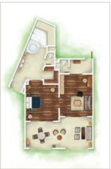
Senior Suite (Beachfront)