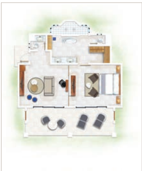
Paradis Suite (Beachfront)