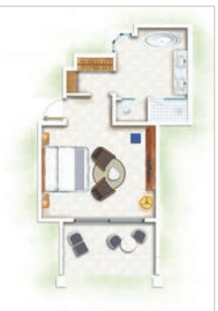
Paradis Room (Beachfront)