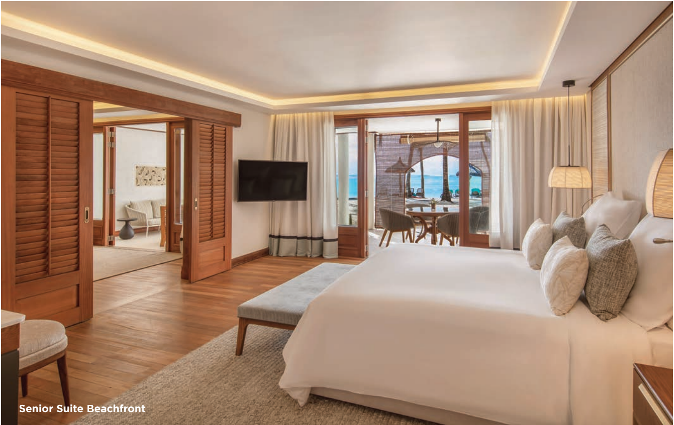
Senior Suite Beachfront