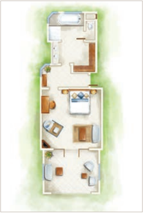
Junior Suite / Junior Suite Beachfront / 2-bedroom Family Suite Beachfront ( interleading )