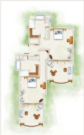
2-bedroom Family Suite