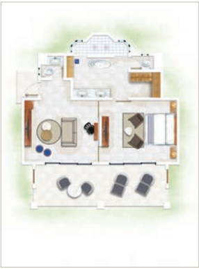
Paradis Suite Beachfront