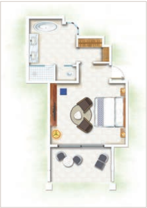
Paradis Beachfront / 2-bedroom Paradis Family Suite Beachfront ( interleading )