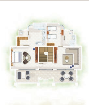
Paradis Luxury Family Suite Beachfront