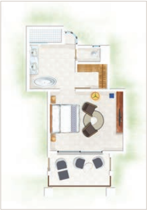
Paradis Bay Facing