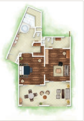
Senior Suite Beachfront