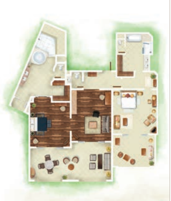
2-bedroom Senior Family Suite Beachfront