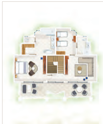
2-Bedroom Paradis Luxury Family Suite Beachfront