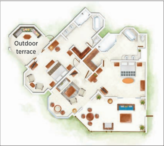
2-Bedroom Senior Family Suite (Beachfront)