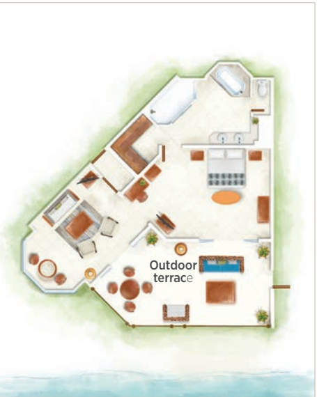
Senior Suite (Beachfront) / Senior Zen Suite (Beachfront)