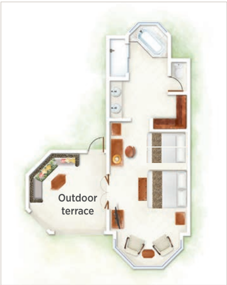
Junior Suite (2 adults + 2 children) / Junior Suite (Beachfront) (2 adults + 2 children) / Zen Suite / Zen Suite (Beachfront)