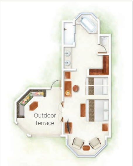
Junior Suite (2 adults + 2 children) / Junior Suite Beachfront (2 adults + 2 children) / Zen Suite / Zen Suite Beachfront