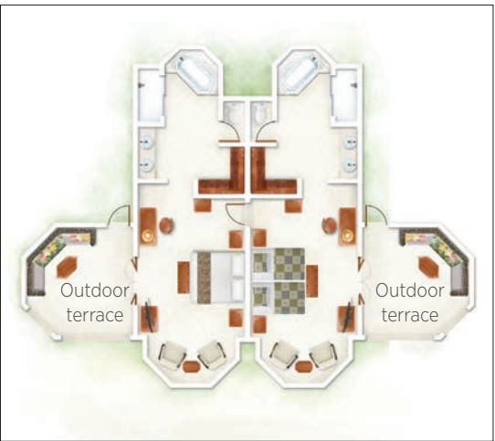
2-Bedroom Family Suite