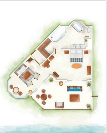
Senior Suite Beachfront / Senior Zen Suite Beachfront