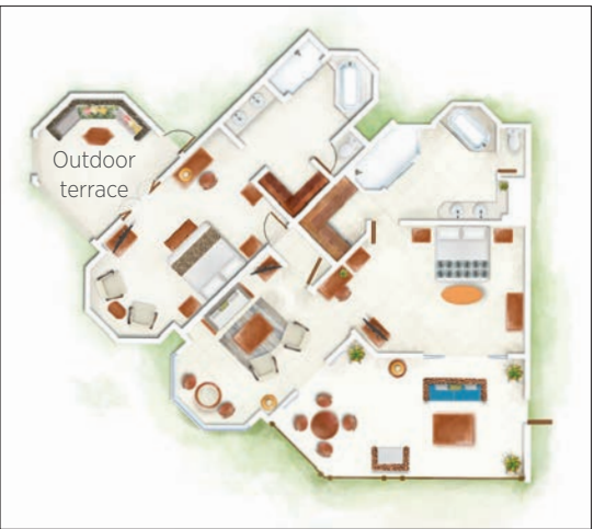
2-Bedroom Senior Family Suite Beachfront