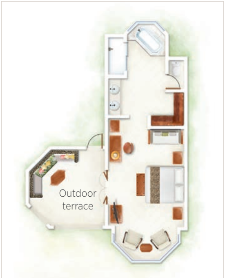
Junior Suite / Junior Suite Beachfront / Zen Suite / Zen Suite Beachfront