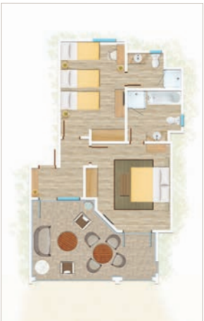
2-Bedroom Family Apartment (Garden Facing)