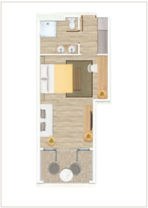
Superior Garden / Superior Sea Facing