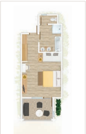
Deluxe Sea Facing Room