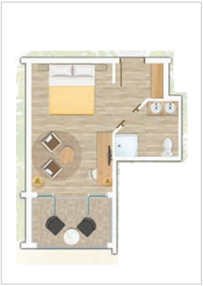
Standard Sea Facing