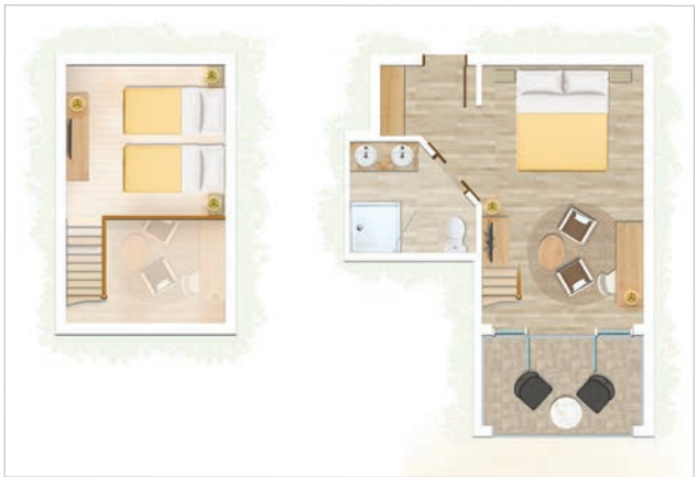
Family Duplex Garden Facing / Family Duplex Sea Facing