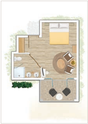
Standard Garden Facing