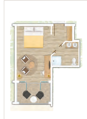
Standard Sea Facing