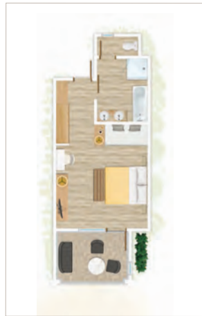
Deluxe Sea Facing Room