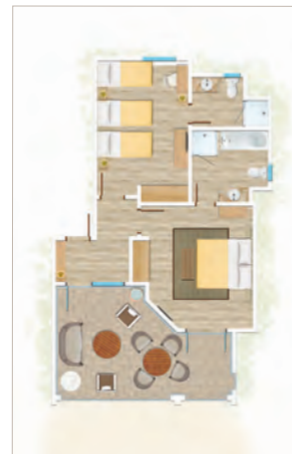
2-Bedroom Apartment (Garden Facing)