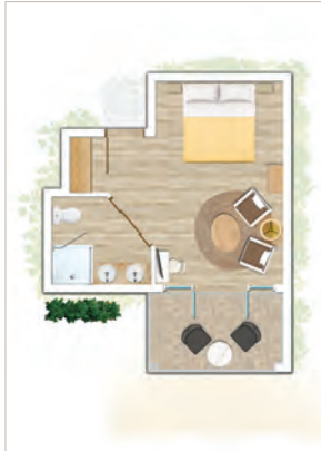
Standard Garden Facing