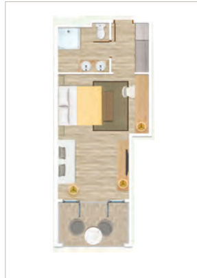
Superior Garden / Superior Sea Facing